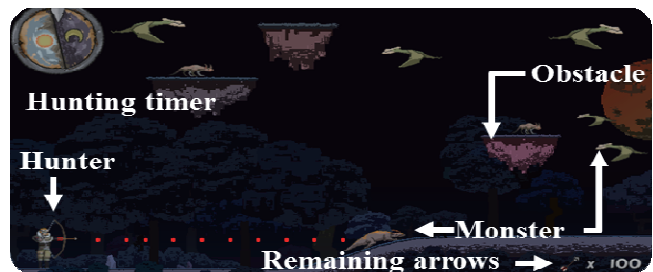
Figure 2 Hunting Ground

For the hunting task, the player is provided with sixty seconds time to hunt. In the hunting ground, the monsters are walking and flying while the obstacles are also placed at various locations. The player has to shoot the arrows to kill the monsters. Each monster is killed by one arrow shoot but the food quantity obtained by each monster is different based on its size as seen in Figure 2. After hunting, the quantity of killed monsters is transferred to HP. Based on the resources; the player can choose to add another member in the group. These members can also perform the same four tasks. However, the main character is responsible for the decision making and resource management.